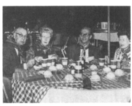
An authentic Western barbecue highlighted the annual meeting this spring in Texas. AOCS members, decked out in red bandannas, were treated to a barbecue buffet and entertainment during the 62nd annual meeting held May 2-6 at the Shamrock Hilton Hotel in Houston.